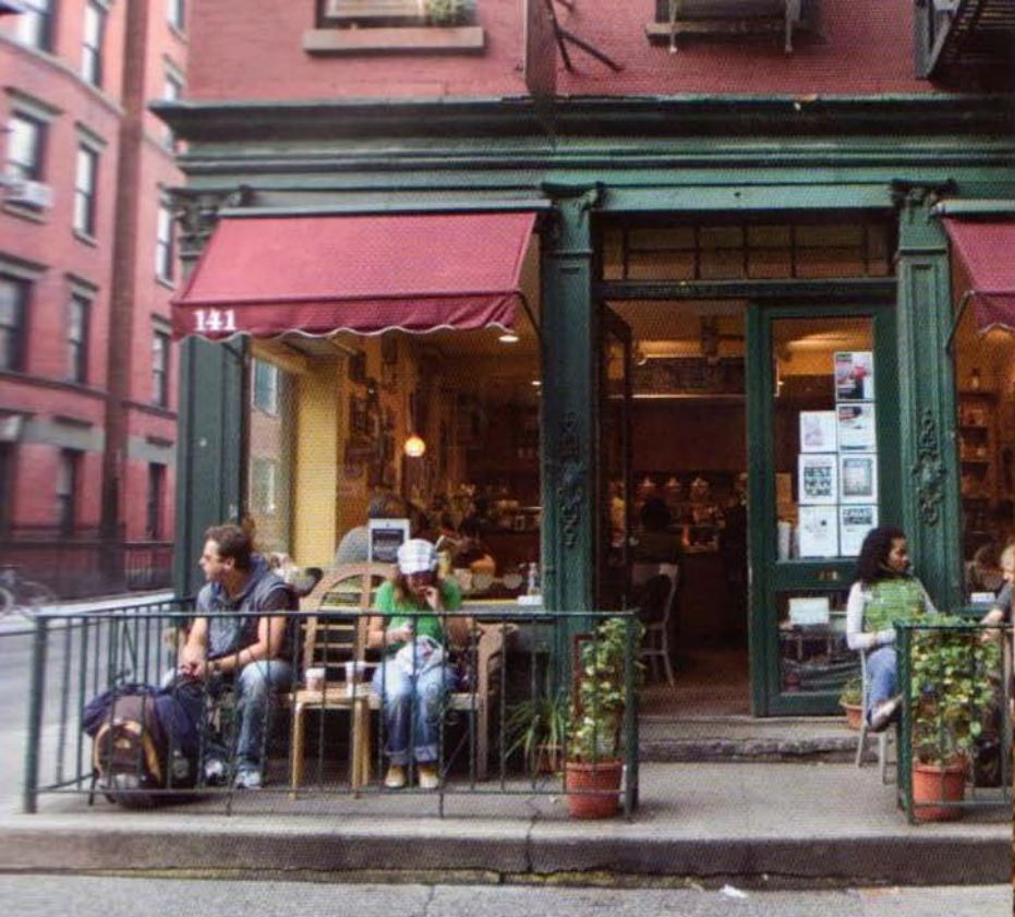
The Art of Joe, left, has four locations in Manhattan. Latte art at Via Quadronno, below.